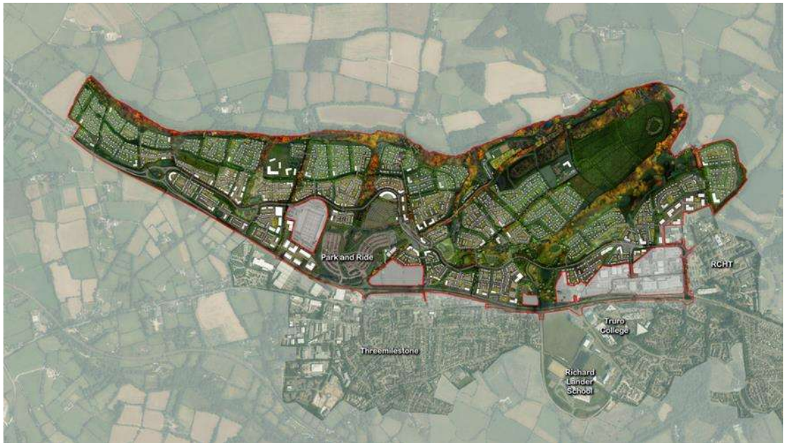
Figure 1 – Illustrative Masterplan