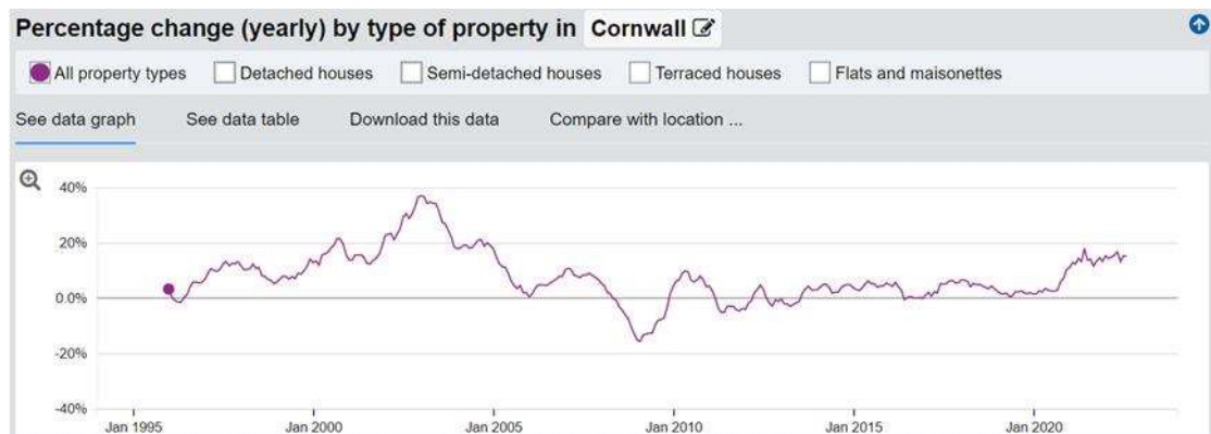
Figure 4 Average House Price for Cornwall (Land Registry, 2022)